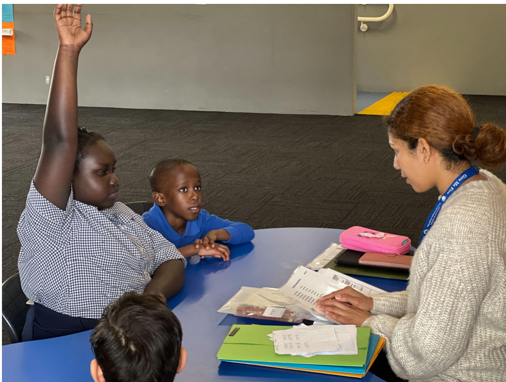
Our Give Me 5 focus is to not get distracted and 'Be Respectful in the Learning Areas'