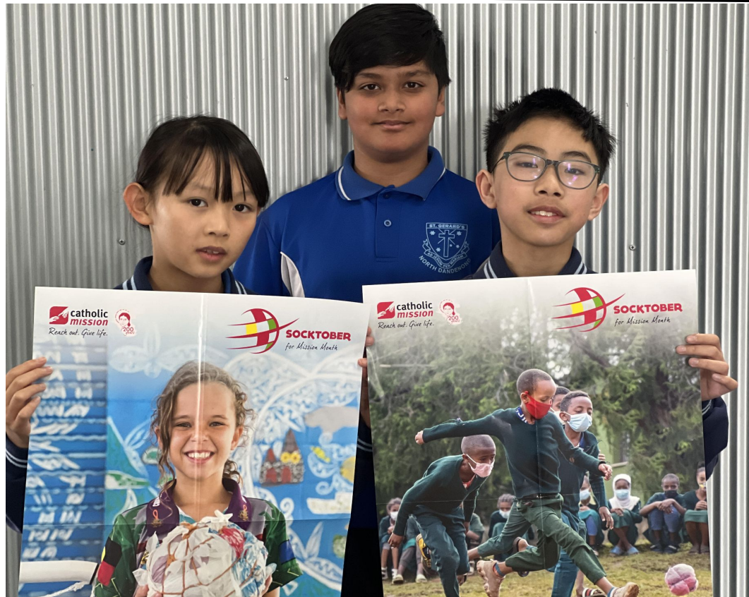
Our Social Justice Leaders are promoting Mission Month during October

This week we launched Mission Month. The theme of this year's World Mission Day is "You shall be my witnesses."