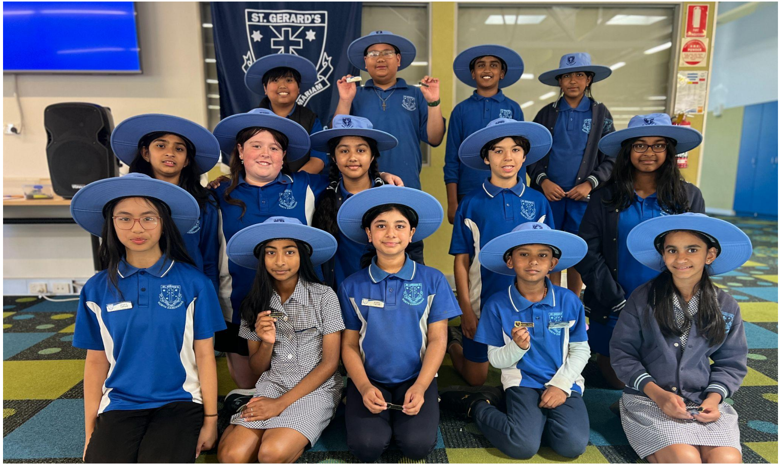
Year 6 Leaders: Empowered with Faith, A Journey of Leadership, Guided by Blessings. 🌟👑 #BlessedLeadership