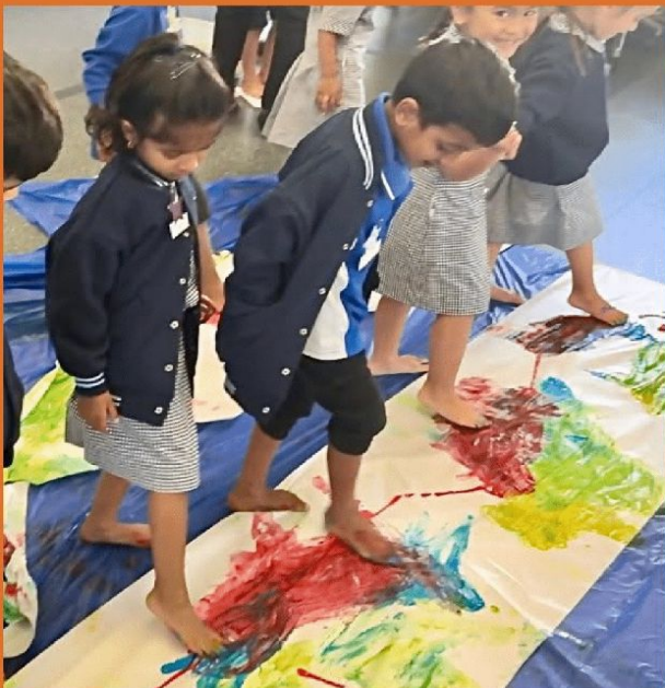
Foundation students dancing in the paint