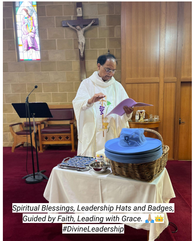
Spiritual Blessings, Leadership Hats and Badges, Guided by Faith, Leading with Grace. 🙏👑 #DivineLeadership