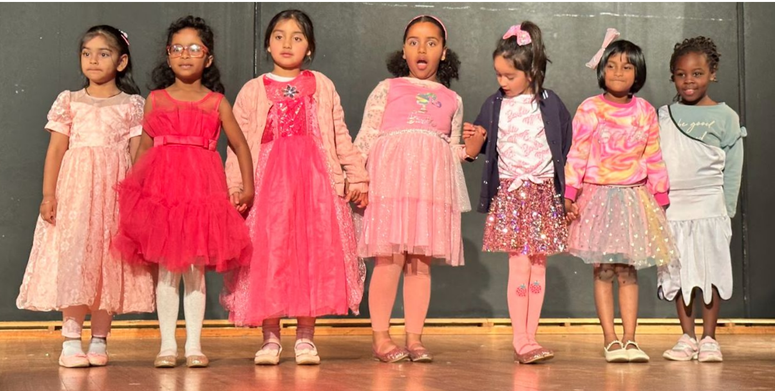
Prep Girls Shine Bright, Embracing Saint Gerard's Light at our Talent Quest!