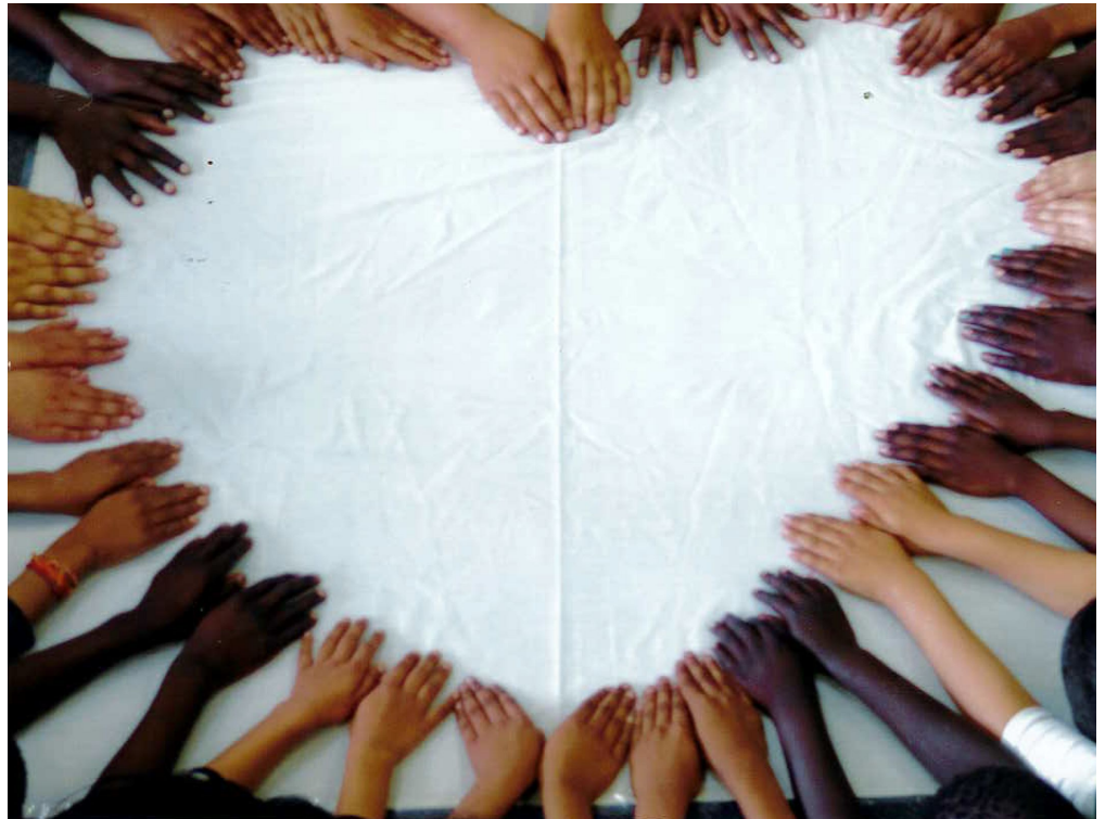
Artwork by 3/4 S 2015