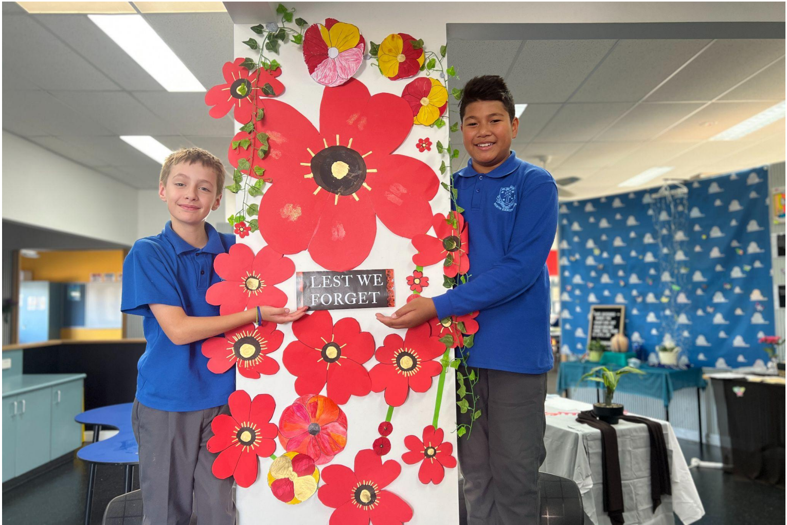
Honouring the brave souls of ANZAC through our heartfelt tribute – a display crafted with reverence and remembrance.