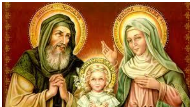
Joachim and Anne the father and mother of Mary, and the grandparents of Jesus.