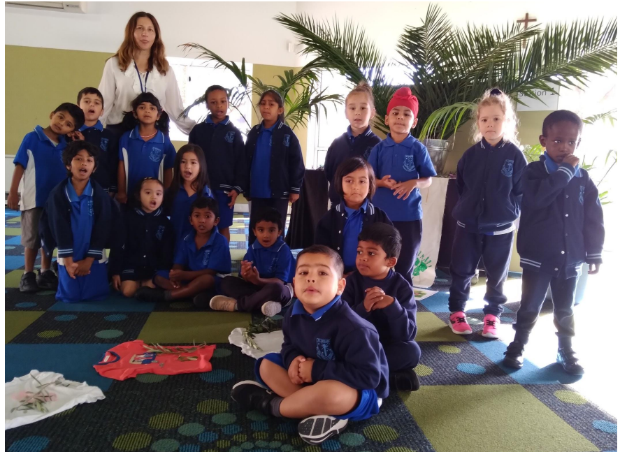
Preps display their Palm Sunday Prayer Space