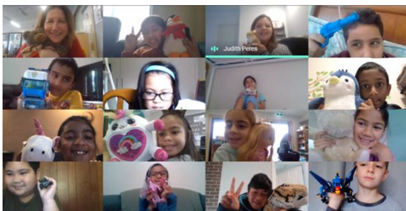
The 1/2 students were being respectful in their Google Meet by taking turns and listening to each other share information about their favourite toy.