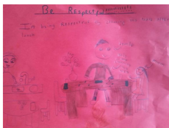
Lemilo in 1/2FP is being respectful by helping his mum to clear the table after meals.

This week the whole school focus was 'Respectful'.