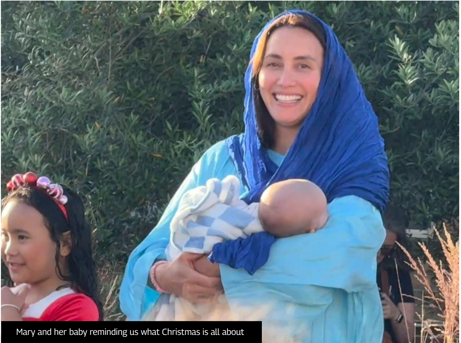
Mary and her baby reminding us what Christmas is all about