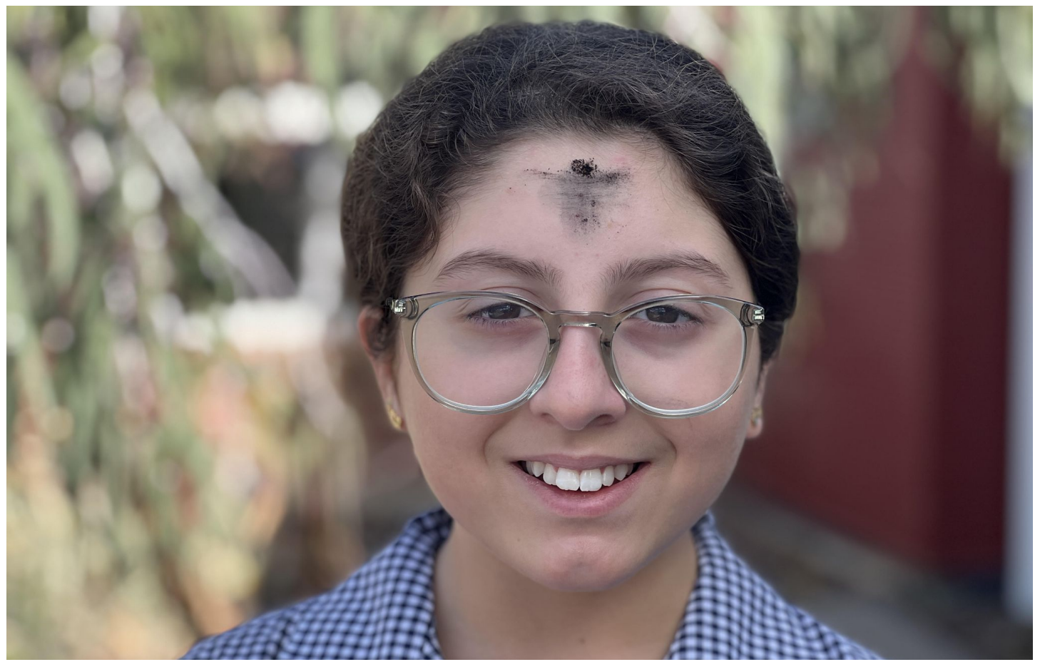
Our students received ashes on their foreheads last Wednesday, reminding us of the call to repentance and renewal during Lent.

Ash Wednesday, which marks the beginning of the Lenten season, was observed last Wednesday. Our children participated in the tradition of receiving ashes on their foreheads as a public expression of faith and humility. Lent is a period of prayer, fasting, and almsgiving. Let us take this opportunity to reflect, renew, and deepen our commitment to living a life of compassion and generosity.